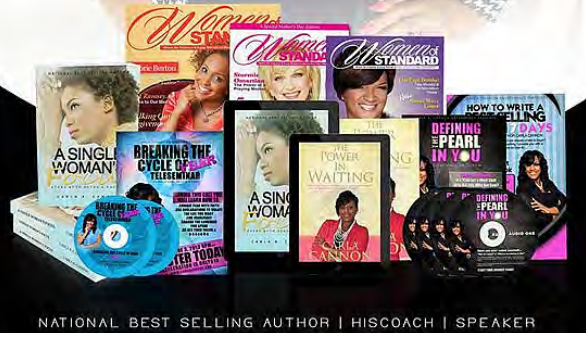
NATIONAL BEST SELLING AUTHOR | HISCOACH | SPEAKER